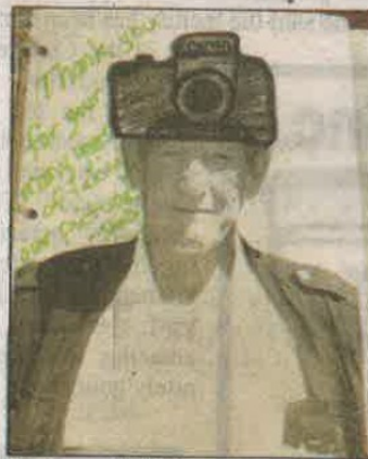
The 'Man With the Funny Hats' was recently recognized by the United Church for his outstanding work.