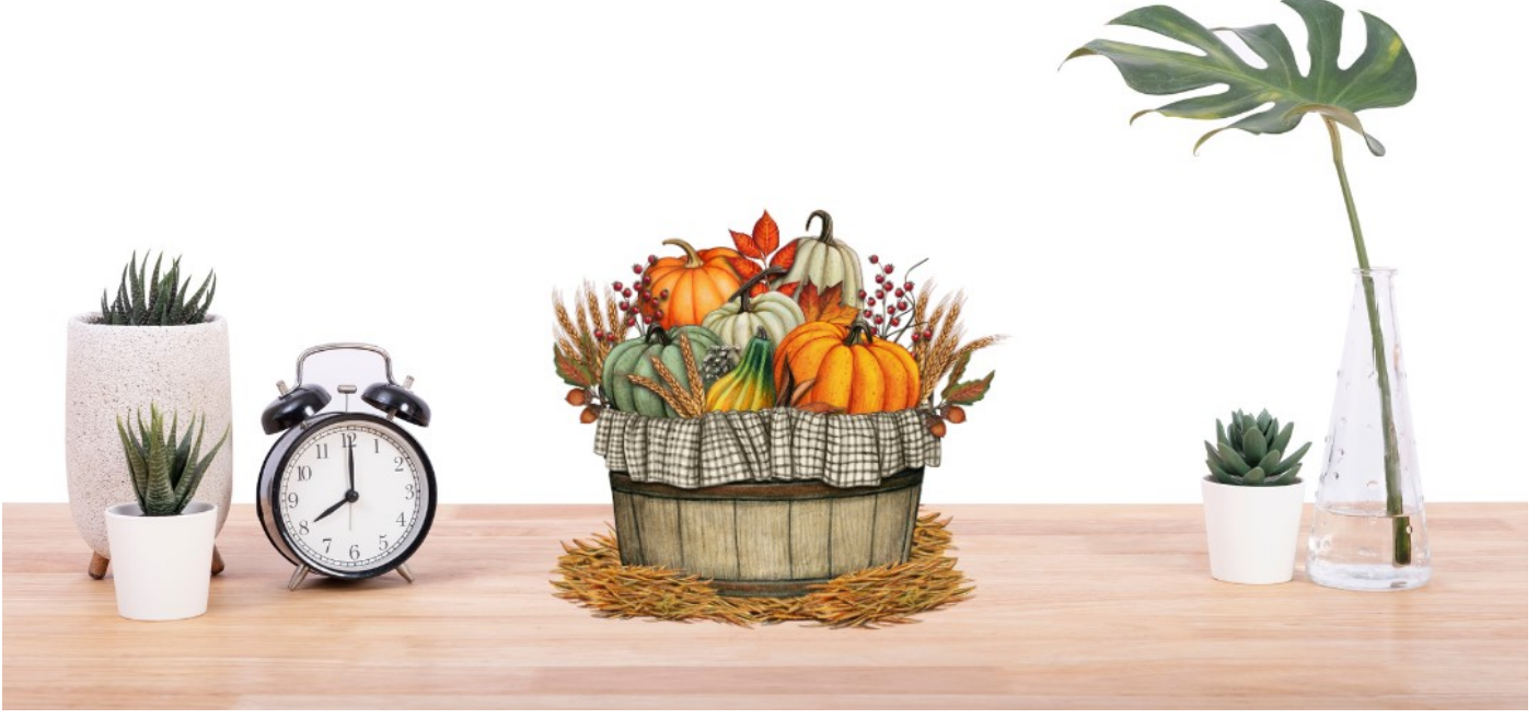
"The more you practice the art of thankfulness, the more you have to be thankful for."