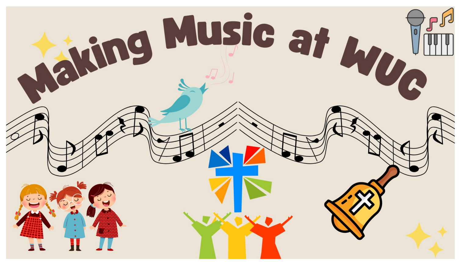
Hello! from the Music Room

It's the season of darker evenings. I love this time when the skies grow softly dark and we bring light out of that darkness with candles, holiday lights – even night lights that lead us along our way from place to place. That quality of light is precious.