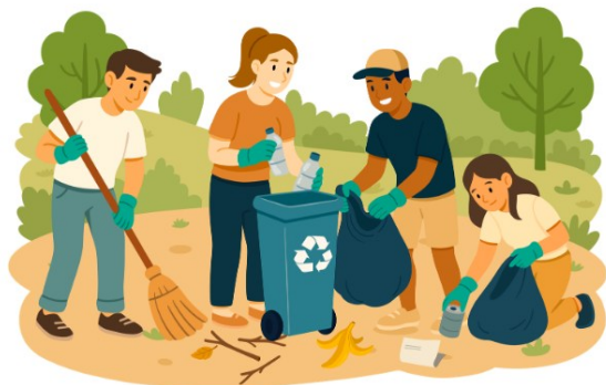
Friends from the church joined the Town clean up day on May 2 nd